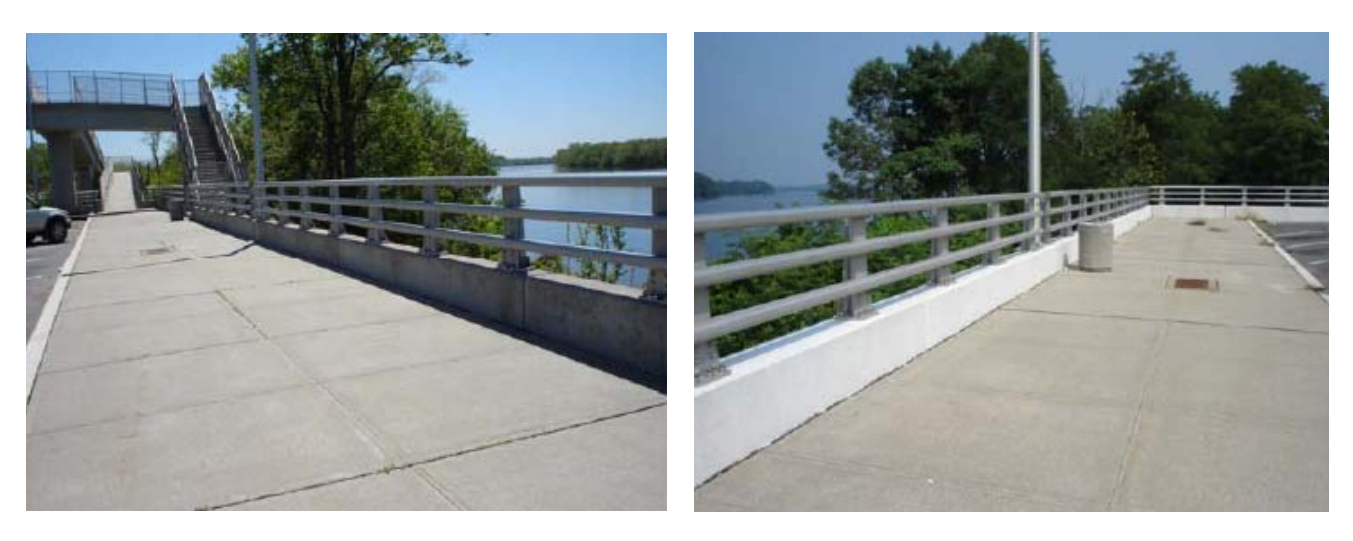
Figure 5. Uncoated Concrete Surface (on the left) and Coated Surface (on the right)

In the summer of 2005, the Rutgers team, under the supervision of Professor Balaguru, applied the coating with paint rollers and brushes. Care was taken to prevent spills on the concrete slab next to the wall and on metal posts attached to the wall on the top. The safety railing posts and adjacent floor slabs were taped to protect these areas from any drips or spills. A time slot that provides two dry days was chosen for the application. However, for one application it rained heavily starting 3 hours after the application, but the coating was not damaged. The uncoated concrete surface and coated surface are shown in Figure 5. A close-up view of uncoated and coated surfaces is shown in Figure 6. Another close-up view of the coated surface is shown in Figure 7.