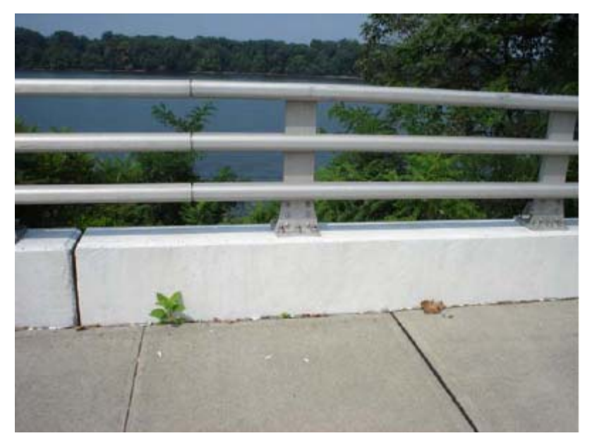
Figure 7. Close-up View of Coated Surface