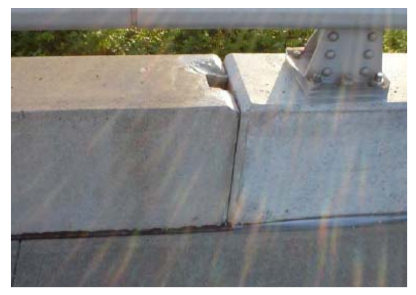
Figure 6. Uncoated Concrete Block Next to a Coated One