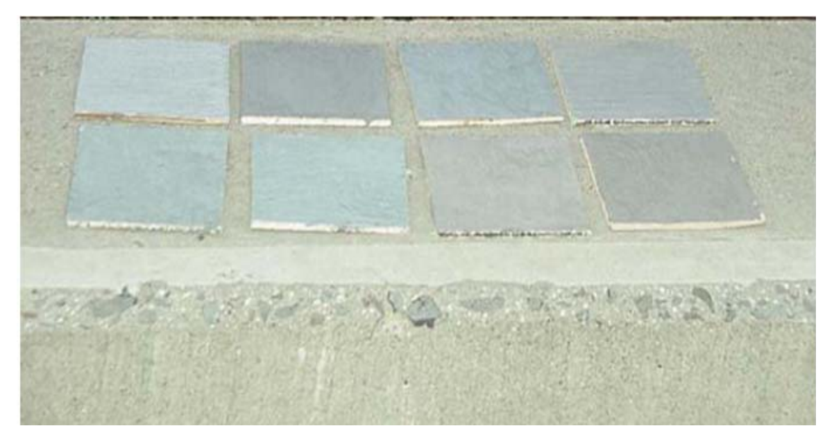
Figure 3. Various Color Schemes to Match the Color of Parent Concrete Surface

The existing Geopolymer formulation with 1% discrete carbon fibers was modified using pigments to obtain a white concrete color. Small slabs coated with the modified matrix (Figure 3) and small patch applications at the back of the structure were used to obtain NJDOT approval. A typical trial patch is shown Figure 4. The approved color for the coated surface looks closer to a white concrete surface.