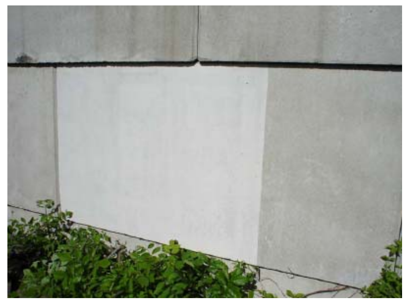
Figure 4. Test Patch (More Than Two Years Old)

Figure 3. Various Color Schemes to Match the Color of Parent Concrete Surface