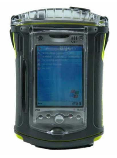
Figure 2. Otterbox Armor 1900 protective case.

We have been using this case and have been very satisfied with it so far. We would recommend continue using it in Year 2, equipped with the Serial Pod adapter.