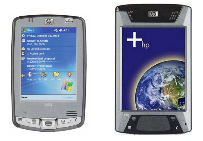
Figure 1. "Hands-on" comparison PDAs.

We acquired several PDAs, as "representatives" of their family, and performed "handson" comparison. The PDAs we selected were: HP iPAQ hx2410 and HP iPAQ hx4700. Below are our "hands-on" comparative reviews.