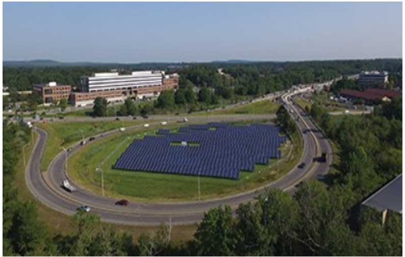
The Massachusetts Department of Transportation installed these solar panels in the right-of-way at Exit 13 North on the Massachusetts Turnpike (I-90) in Framingham. The State DOT has installed several solar projects at multiple sites.